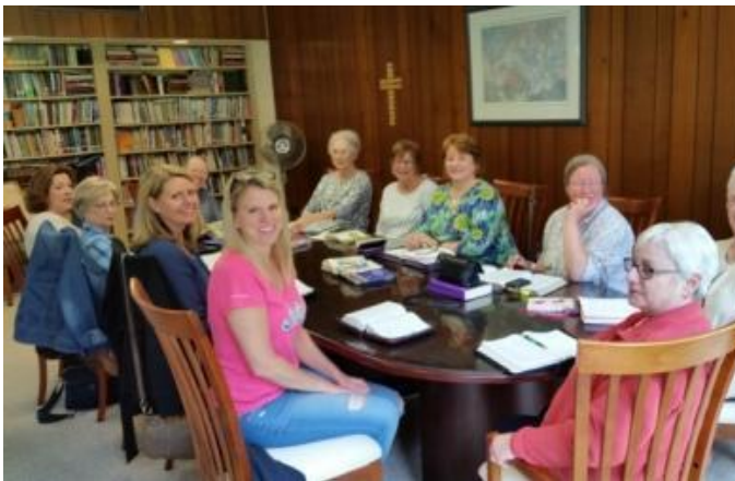
Join the Ladies Bible Study!