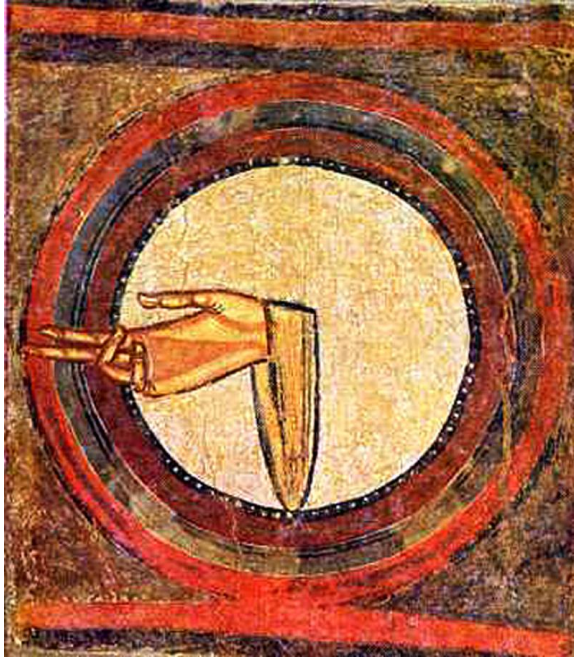
Hand of God - mural fragment