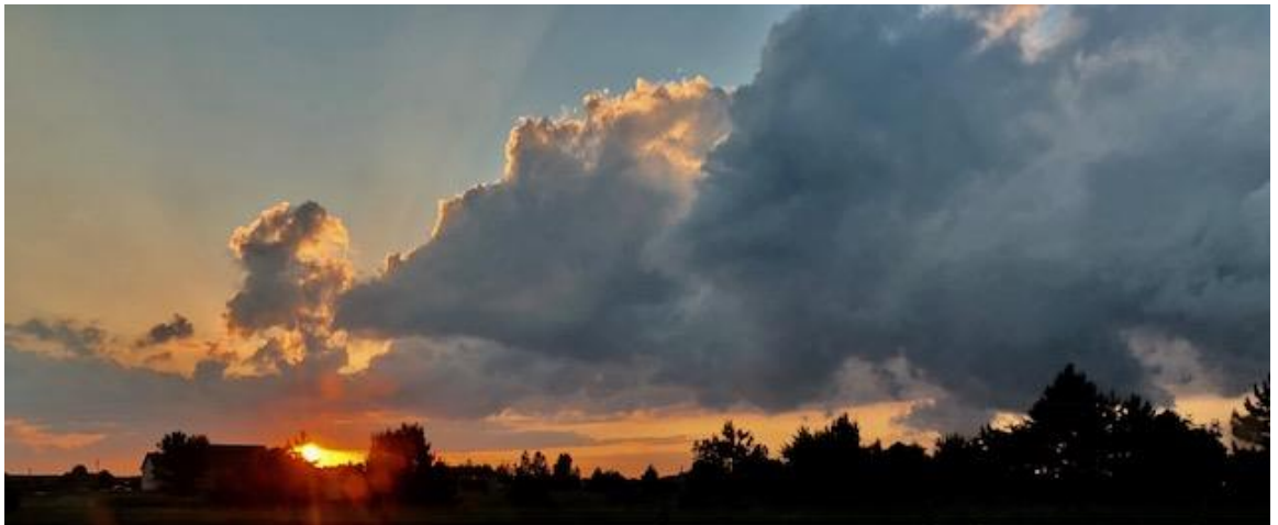
Fall skyline near St. Andrew