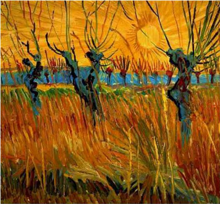
Willows at Sunset, 1888 Vincent van Gogh

St. Andrew Episcopal Church Mentor, Ohio 440-255-8842 standrewmentor@gmail.com http://standrew-mentor.com