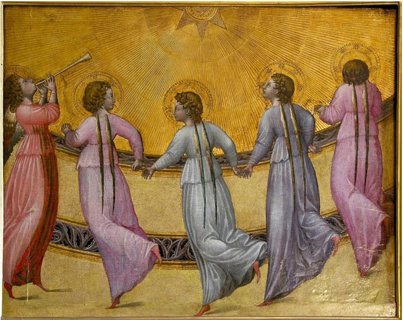
Angels Dancing Giovanni di Paolo, 1436