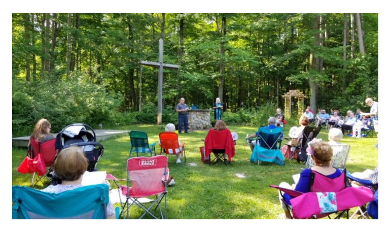
A Lector reads the scripture at an outdoor service.